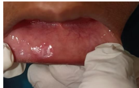
Fig 8: Follow-up after 1 month

In histopathology H & E stained section revealed overlying stratified squamous surface epithelium with underlying fibrovascular connective tissue. (Fig no – 9). The mucin pooled area surrounded by chronic inflammatory cells along with presence of foamy histiocytes is noted in the submucosal region. No malignant cells noted in the sections. Confirmed diagnosis made the mucous extravasation cyst.