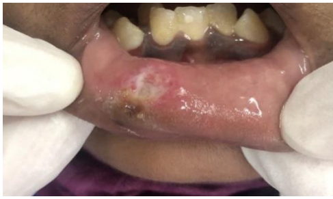
Fig 7: Follow-up after 7 days