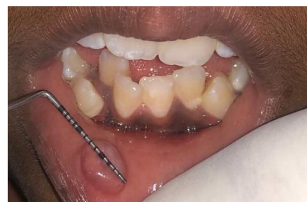
Fig 2: Local infiltration of LA at surgic