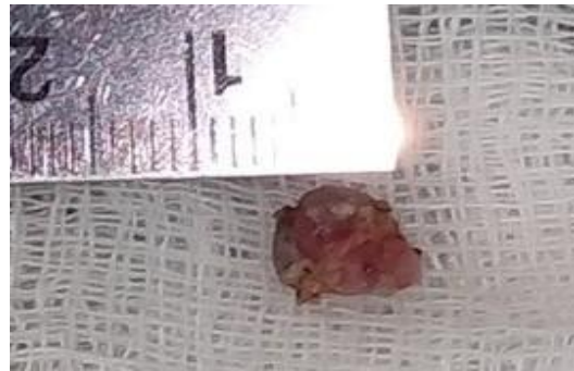
Fig 5: Separate the lesion (Exicion of the lesion)

The excised tissue was sent for biopsy at oral pathology department of (Fig no – 6).