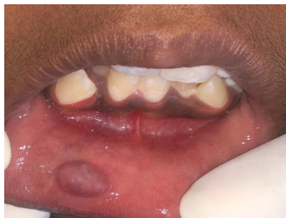
Fig 1: Asymptomatic swelling in lower lip

A 12-year-old female patient presented with her parents at our department of periodontology complaining of asymptomatic swelling in the labial mucosa of her right side of lower lip. (Fig no – 1) The mother reported that it started 8 months back before and changed episodically in size and color. Patient gives a history of similar growth in the same region and excision of the growth was done 2 weeks back. They reported habit of lip biting. There was no history of any systemic disease.