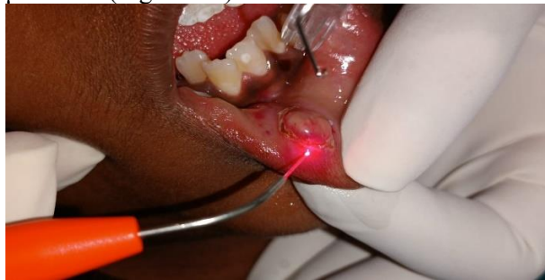
Fig 3: Diode laser machine power and wave length set for surgery

Removal of the lesion was performed using a diode laser at continuous mode in a contact technique with a power setting of 1.3W, wavelength 810nm, 300µm fiber. (Fig no – 3)