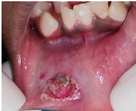
Fig 4: Circular incision done by diode laser

First a circular incision was made around the lesion to obtain a proper biopsy sample. (Fig no – 4) Dissection was performed to separate the lesion and associated minor salivary gland. (Fig no – 5)