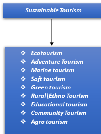
Fig 1. Different forms of sustainable tourism

Sustainable practices which are existing in the tourism industry and also the sustainable initiatives taken up by the tourism industry truly defines the term sustainable tourism. Even though there are both positive and negative impacts the predominant goal is to minimize the negative outcomes. As quoted by the UNWTO and UN Environmental program on sustainable tourism is something which takes the full accountability of the ongoing and upcoming episodes which are related to environment and economy. Sustainable tourism also means creating a balance between these three aspects. It also sheds light on the requirements of the industry, its visitors and also the local residents. Sustainable tourism runs on the three core concepts namely economic sustainability, environmental sustainability and social sustainability. These concepts are also named as profits, planet and people.