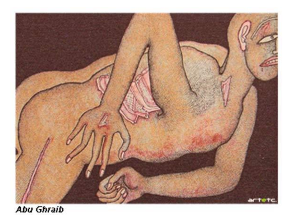
Jogen Chowdhury, Abu Ghraib, mixed media on paper

Now question arises how does art and artist affect culture and society? Art has an effect on society because it changes the attitudes and conveys the ideas and thoughts. It touches the core of the individual. Whereas artist has a unique and essential role to play in making our society better, healthier, and more prosperous. With their creativity, they can bring joy, connection, and inspiration in the society and can also provide critical analysis of our political, economic, and social structures through their expression, which can encourage and prompt people to think critically and engage constructively to take action towards social progress. As an artist possesses the capacity to feel strong, to be sensitive to objects and to express this through the way they paint, the way they gesture, or the color they use. The artist can feel the ambience, the aura of a space or the recollection of a sensation and capture it in their work. In some cases, the artist may find it difficult to bear the burden of being so sensitive. And being sensitive is not easy for artist.