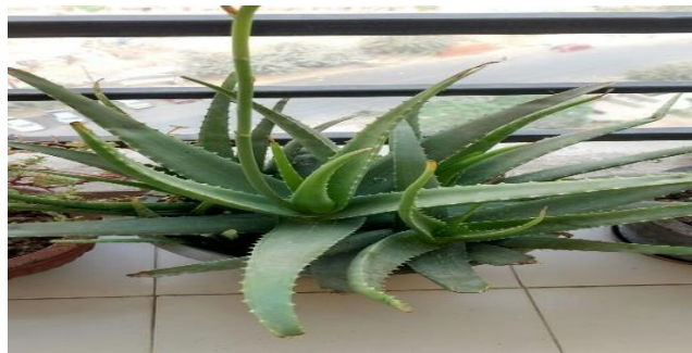
Figure 3: Aloe-Vera

Botanical name: Aloe barbadensis . Aloe vera is very good for the skin and helps to tone your skin. Aloe vera is also beneficial for the PCOS condition; it's also helpful for nourishment as well as hormone regulation. In the present study, 42 women took 30 ml of this aloe vera juice, which was mixed with a little milk and taken in the morning on an empty stomach for 21 days. It will help you with early menses by correcting for date as well as purifying your blood. And the results were amazing. It was very helpful to all women, and they also got relief from stomach pain during periods.