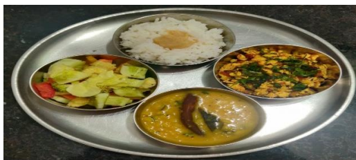
Figure 6: Healthy plate

First thing first, you need to stop eating packaged, processed foods for a while and switch to only fresh foods. It's not that difficult; just practise the healthy plate method. When you say to "eat," fill half your plate with fresh vegetables. \frac{1}{4} of that plate with the protein-rich food like dal or paneer, and the remaining one-fourth with complex carbohydrates like roti, rice, or millet. Make sure to add 1 TSP of desi ghee to your meal, even though it is highly recommended to directly have 1 TSP of cow ghee on an empty stomach to treat PCOS. Seasonal fruits must be a part of your daily diet; eat them during the day.