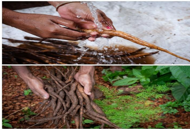
Figure 2: Shatavari

Botanical name: Asparagus racemosus . Being a powerful adaptogenic herb, it not only relieves one from physical and emotional stress but also manages diabetes mellitus and prevents high cholesterol and triglyceride levels. In a study, 26 women took asparagus regularly for 3 months between the age group 18-34 years. Their menstrual cycle, pregnancy, etc.- all problems and side effects are documented. After 3 months, 19 out of 26 women have cured the problem of menstrual irregularities and hormonal imbalance. Shatavari was taken by women with milk and some in the form of juice.