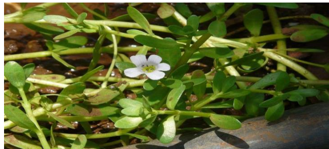
Figure 4: Brahmi

Botanical name: Bacopa monnieri . Brahmi is a very popular herb or brain tonic that is used in children for improving academic performance, but it is also an excellent herb to include in your PCOS management. That is because hormonal imbalance also affects