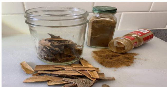
Figure 5: Cinnamon

Botanical name: Cinnamomum zeylanicum . In this study, 15 women who have PCOS have taken cinnamon daily for 8 weeks with added cinnamon in a smoothie and spice mix for dinner meat. After post-treatment, insulin resistance is decreased slowly. If insulin is not regulated, it puts women with PCOS at high risk for chronic diseases down the road.