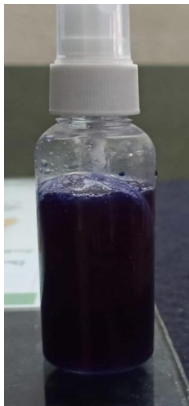
Fig. Herbal face toner