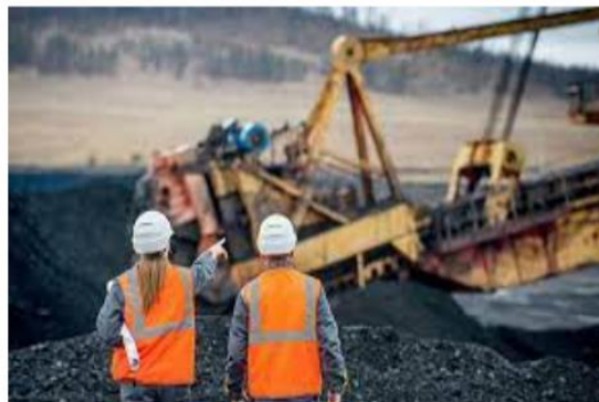
Figure 1.1: Mining

The accident is any uncertain activity due to unavoidable circumstances and carelessness of some people. This incident is happening continuously all around the world. A large number of workers (approximately 2.3 million) die each year worldwide, 350,000 because of occupational accidents and approximately 2 million because of occupational diseases. Occupational health is defined as an area of application in which the effects of work life on health are investigated. A public health approach, using the notion of occupational health represents a partial understanding of health, leads to defining workplace and work life as outside of public health. The reasons for that are that citizens are seen not as workers but as consumers and that work life is moved out of the healthcare field. This causes occupational health to detach from public health when organizing healthcare services. The basic area that problems arise in terms of worker's health and safety is the production activities phase. Production activities consist of main activities such as excavation, ground support, and haulage as well as activities such as electricity maintenance, establishing and managing pressurized room networks, communication and signalization systems, and maintenance and repair of various machines