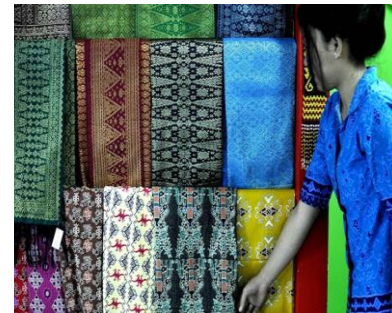
Fig. 4. Sasirangan

The method of data collection in this study was carried out by 2 (two) methods, as follows: