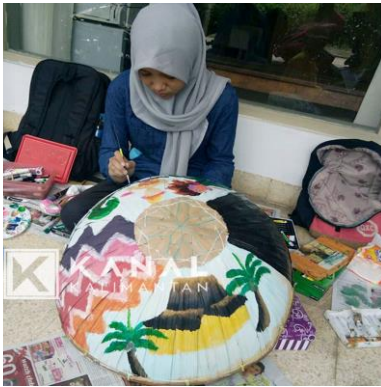
Fig. 2. Tanggui

The population of this research is all SMEs business owners in Banjarmasin City. Based on this population, a stratified random sampling method was used for the sampling method of SME business actors. This is done to reduce the error rate. The use of this sampling method is because the SMEs that are the subject of research are SMEs with different types of businesses and occupying different geographical locations. This research focuses on SMEs Home industry products Tanggui ( Tanggui is a typical Banjarmasin hat that is large in size, made of palm or sago palm leaves), Amplang (typical snack food culinary products, made from home-made mackerel fish) and Sasirangan ( Sasirangan is a traditional cloth made in South Kalimantan). According to Roscoe (1975) quoted by Uma Sekaran (2006). To obtain good results, the number of samples is between 30 and 500. So the number of samples used in this study is 30 SMEs for home industry products of Tanggui , Amplang and Sasirangan in Banjarmasin City.