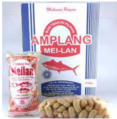
Fig. 3. Amplang