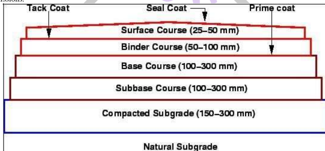
Fig Flexible Payment Components

The highway pavement is made up of superimposed layers of materials manufactured over the normal subgrade of the surface, whose primary purpose is to disperse the loads of the automobiles employed in the subgrade. The construction of the pavement will be capable of delivering an appropriate surface condition, sufficient skid resistance, desirable light reflection properties, and low noise emissions.