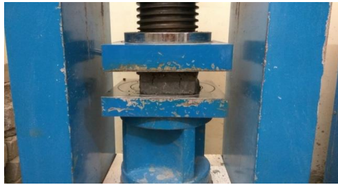
Fig.2 Brick Testing