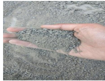
Fig.5 Construction sand