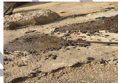
Fig.7 Pothole filled with mix