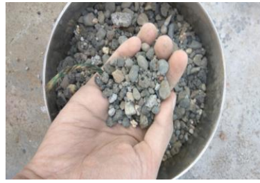
Fig.4 Coarse sand (River gravel)