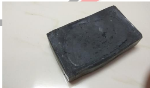
Fig.1. Brick made from waste plastic bags.

All Many plastic bags are used only once, this usage is very less in comparison to their long lifespan. Thin plastic bags in particular represent a serious ecological problem. They are easily tossed by the wind and we can see many stretches of land turned into landscapes of plastic. Also, they land in rivers and streams and ultimately in the sea. According to a study, it is estimated that it takes 500 years for a plastic bag to decompose when exposed to sunlight. If it is not exposed to sunlight, say it remains at the bottom of the landfill, the plastic may remain intact indefinitely. Although standard polyethylene bags don't biodegrade, they do photodegrade. When exposed to ultraviolet radiation from sunlight, polyethylene's polymer chains become brittle and start to crack. This suggests that plastic bags will eventually fragment into microscopic granules. However, scientists aren't sure how many centuries it takes for the sun to work its magic. That's why certain news sources cite a 500-year estimate while others prefer a more conservative 1,000-year lifespan.