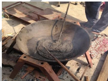
Fig.6 Mixture for filling Pothole

According to the report of TOI(Sept 21,2017,11:42 IST) Pothole-ridden roads have claimed 11,386 lives across the country over the past four years, which translates into roughly seven deaths a day. The material from which Plastic Bricks are made can be poured into potholes on road. This material immediately settles with any road texture and sticks to the base.