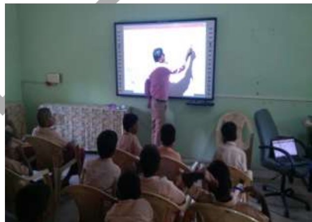
Photo: Conducted experiment through SVC