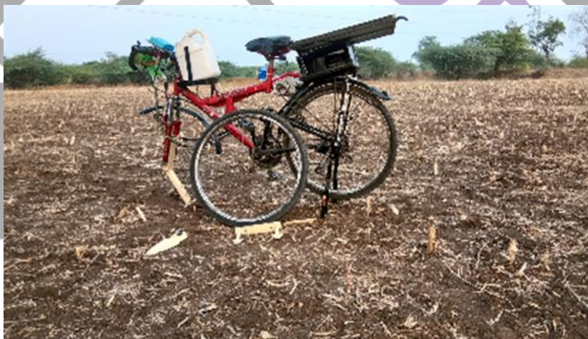
Fig. Actual Modelling of Project