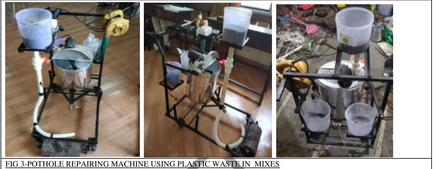
FIG 3-POTHOLE REPAIRING MACHINE USING PLASTIC WASTE IN MIXES

The working of the machine is quite simple and is carried out in four operation and they are as follow –