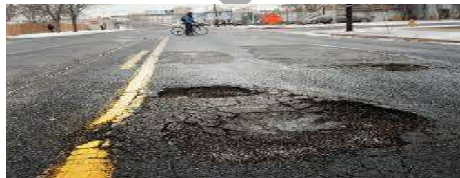
Fig. 1 -Pothole

A pothole is a structural failure in a road surface, usually asphalt pavement, due to water in the underlying soil structure and traffic passing over the affected area. Water first weakens the underlying soil; traffic then fatigues and breaks the poorly supported asphalt surface in the affected area. Continued traffic action ejects both asphalt and the underlying soil material to create a hole in the pavement.