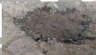
Fig -POTHOLE PATCH BY USING PLASTIC WASTE

The mixer outlet is pointed about the pothole and the mixes made is pour into the pothole. A maximum of 4 to 5 pothole can be patch at a time .After patching the pothole the mixes get cooled within 10 minute-15 minute. After filling mixes in the pothole some amount of cement is sprinkle on the top to reduce the stickiness.