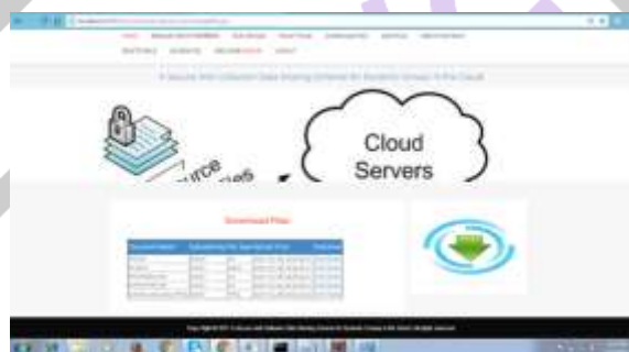
Figure 8. Select File for Revoke