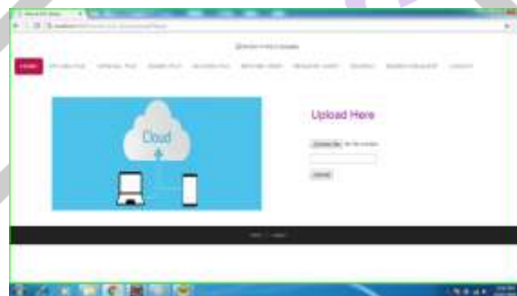
Figure 3. Upload File