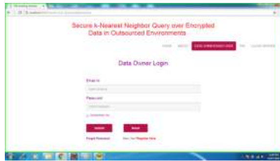
Figure 1. Data Owner Login