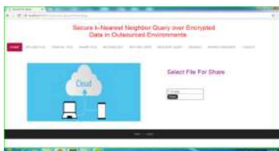
Figure 5. Select File for Share