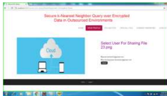
Figure 6. Select User for Share