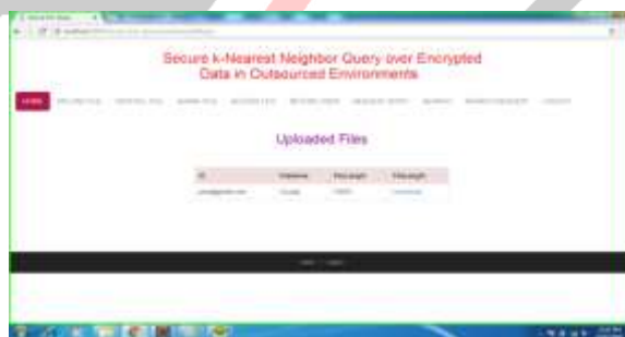
Figure 4. Uploaded Files