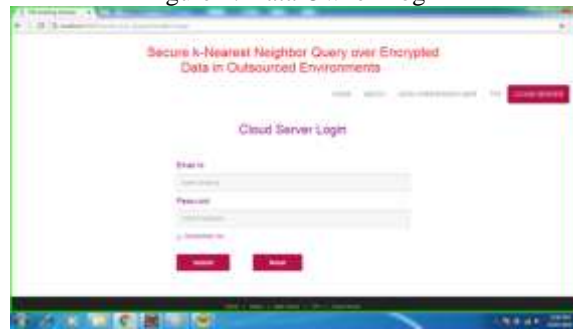
Figure 2. Cloud Server Login