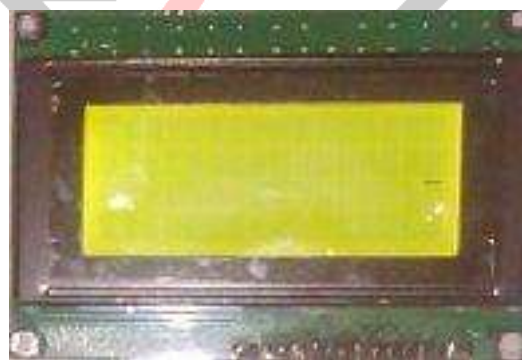
Figure 3: Picture of LCD

A liquid crystal display (LCD) is a thin, flat display device made up of any number of color or monochrome pixels arrayed in front of a light source or reflector. Each pixel consists of a column of liquid crystal molecules suspended between two transparent electrodes, and two polarizing filters, the axes of polarity of which are perpendicular to each other. Without the liquid crystals between them, light passing through one would be blocked by the other. The liquid crystal twists the polarization of light entering one filter to allow it to pass through the other [3].