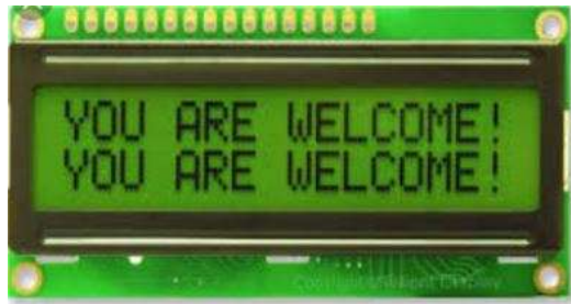
Figure 4: Smart Notice Board

The message "YOU ARE WELCOME" displayed in the LCD display of the system is shown in Figure 4.