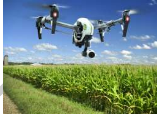
Fig 2. Drones Will Be Used to Improve farming using IoT Technology

An unique opportunity is to create and deliver a transformational suite of Internet of Things-based agricultural management services. These services would be delivered as easy-to-use, smart, connected product applications that would provide customers with the ability to have a real-time big picture of the large and varying data points necessary for them to create optimal agricultural working and growing conditions[4]. To do so in agriculture requires optimizing three key variables: production yield, cost, and risk avoidance, and having a real-time and holistic big picture for optimizing each variable for maximum profitability.