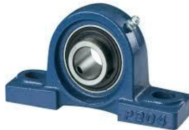
fig. Pedestal Bearing

housings supplied without any bearings and are usually meant for higher load ratings and a