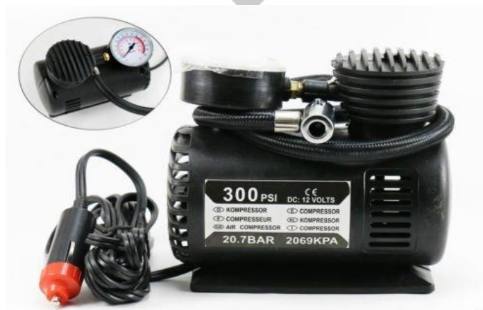
fig. Air Compressor

12V Car Electric Air Compressor Tire Pump - Tire Inflator also for Bikes, Cycles, Boats, Inflatable Toys 100% Brand New 12V Air Compressor/Tire Infiltrator Simply use this for fast & easy inflation of car tires" No strength required for pumping air as it is all electronic & is powered directly from your car battery Perfect for anyone who wants a ease while inflating a tire Time saving as compared to mechanical pump .Quick operation, very Compact and easy to store in car dickey SUITABLE For:- Auto tires, Car/ bike tires, rubber rafts balls Inflates car tires, bicycle tires, rafts and sports equipment such as Basketball, Soccer fast and easily. Also inflates boats, pools, air bed, balloon, etc.