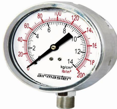
fig. Pressure Gauge

Pressure gauges are used for a variety of industrial and application-specific pressure monitoring applications. They can be used for visual monitoring of air and gas pressure for compressors, vacuum equipment, process lines and specialty tank applications such as medical gas cylinders and fire extinguishers. In addition to visual indication, some pressure gauges are configured to provide electrical output of indicated pressure and monitoring of other variables such as temperature.