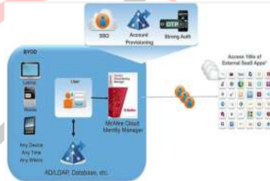
Figure 2. McAfee Cloud Identity Manager

Access control is very important security mechanism for enabling data protection in the cloud computing. It ensures that only authorized users have access to the requested data that is stored in the cloud. There are different security techniques that enable proper access control in the cloud computing. Intrusion detection systems, firewalls as well as segregation of obligations could be implemented on different network and cloud layers. Firewall is enabling only content that is filtered to pass through the cloud network. Firewall is usually configured according defined security policies set by the users. Firewalls are usually related to Demilitarized zones (DMZ) which provide additional security of the data.