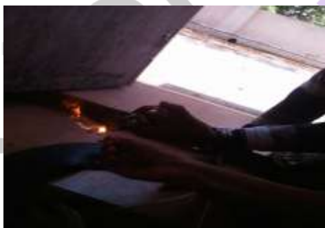
Fig .5: Vigorous burning of flame

The Biogas produced experimentally is measured carefully. After the measurement of gas produced it undergoes the Flammability test. If we kept the lightening match stick near the ball valve in which gas is coming out, it burns vigorously with high flame . This indicates that the produced gas contains high amount of methane