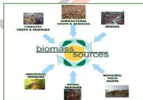
Fig.1: Different sources for biogas production[5]

The origin of biogas starts from 10th century in Assyria for heating bath water. In 17th century that flammable gases could evolve from decaying organic matter. The first digestion plant was built at a leper colony in Bombay, India in 1859. [2] Biogas typically refers to a gas produced by the biological breakdown of organic matter in the absence of oxygen. Biogas can be produced from different sources like cattle dung, agricultural waste, sewage sludge, kitchen waste, biomass etc.