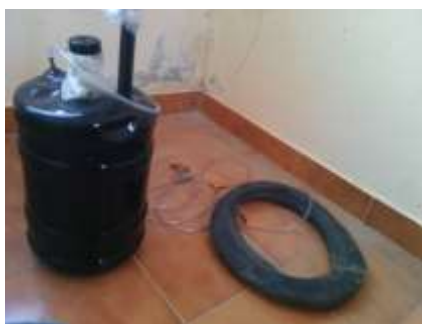
Fig.3. Experimental Setup