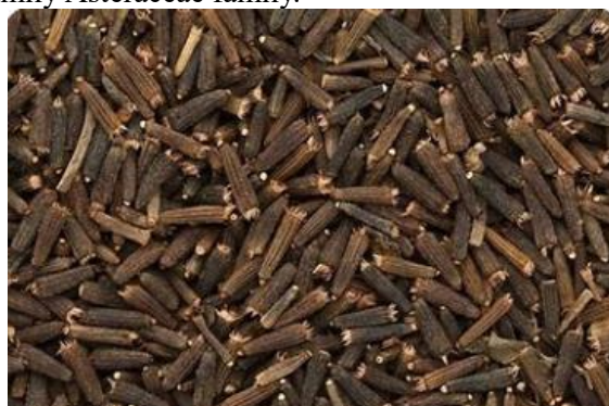
Figure 4: Centratherum anthelminticum seeds

Biological source – Centratherum anthelminticum (L) Kuntze is an ethnomedicinal plant commonly grown in India and Southeast Asia belonging to family Asteraceae family.