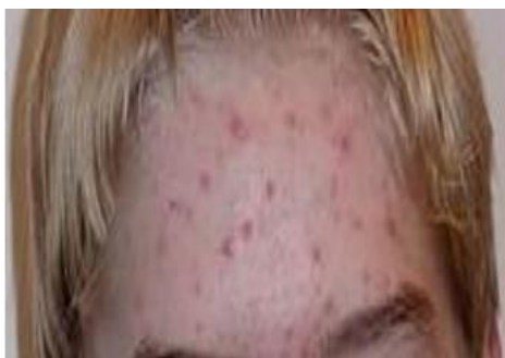
Figure 3: Acne on the Face.

The word acne refers to the presence of papules, scars, comedones and pustules. The common form of acne is known as acne vulgaris. Many teenagers suffer from this type of acne. Acne vulgaris shows the presence of comedones.