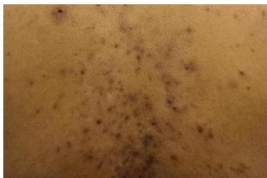
Figure 1: Acne on the Back

Acne vulgaris or simply known as acne is a human skin disease characterized by skin with scaly red skin (seborrhea), blackheads and whiteheads (comedones), pinheads (papules), large papules (nodules), pimples and scarring (2). Acne affects skin having dense sebaceous follicles in areas including face, chest and back (3). Acne may be of inflammatory or non-inflammatory forms (4). Due to changes in pilosebaceous unit lesions are caused by androgen stimulation. Acne occurs commonly during adolescence, affecting about 80–90% of teenagers in the Western world and lower rate are reported in rural societies (5–8). Acne is usually caused by increase in androgens level like testosterone mainly during puberty in both male and female (9).