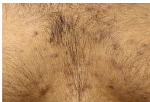
Figure 2: Acne on the Chest