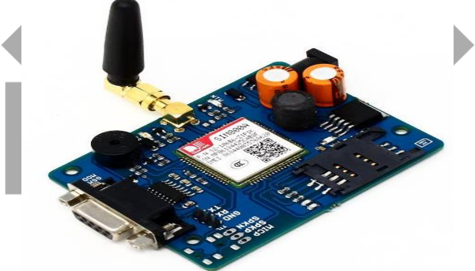
Figure 4 : GSM Module

A GSM modem is a specialized type of modem which accepts a SIM card, and operates over a subscription to a mobile operator, just like a mobile phone. From the mobile operator perspective, a GSM modem looks just like a mobile phone [4,5]. A GSM modem can be a dedicated modem device with a serial, USB or Bluetooth connection, or it may be a mobile phone that provides GSM modem capabilities. The module of GSM is shown in fig.4