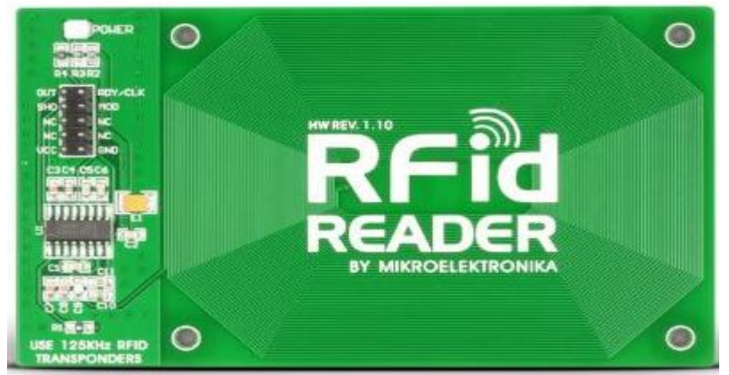
Figure 3: RFID Reader