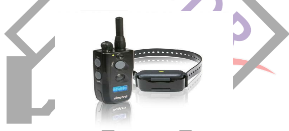
Fig 2: Real time device for tracking time

Now a day's people facing so many problems, in that situation. We can use this tracking device like band, because this device helps us to find out the current situations that are in danger zone. This device used to easily track the position.