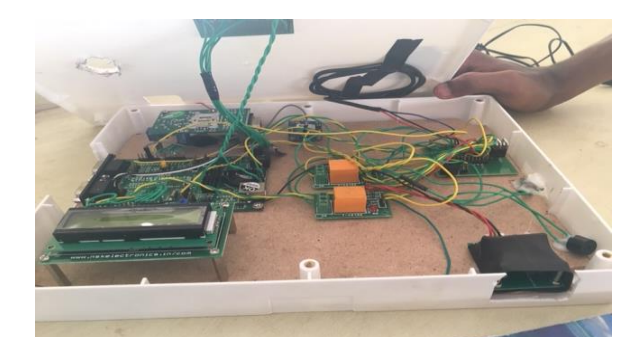
Fig 3: Overall Connection of a Tracking System

Girl found at this place: ,lat: 1257.91264,Lan:07643.69903