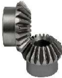
3.5 Bevel gear

Bevel gears are gears where the axes of the two shafts intersect and the tooth-bearing faces of the gears themselves are conically shaped. Bevel gears are most often mounted on shafts that are 90 degrees apart, but can be designed to work at other angles as well. The pitch surface of bevel gears is a cone. Two bevel gears are used which give rotary motion to the net bucket. Bevel gears have 15 and 10 teeth respectively. Diameters of bevel gears are 29.5 mm and 26.5 mm.