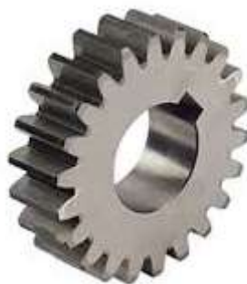
3.4 Spur gear

Spur gear is made of EN36A. Spur gear have straight teeth and parallel to the axis of the shaft. Four Spur gears are used in gear mechanism. Which of this two gear are driver and two gears are driven. Driver spur gears are attached to the Carrier roller and driven gears are attached to the crushing roller. Driver spur gears have 47 teeth as well as driven gears have 36 teeth. Driver spur gears are mounted on square shaft and driven spur gear are mounted on triangular shaft. This assembly is done by using bearings and bearing housing. Bearings are also mounted on this shaft. Bearing is used to enable rotational movement, while reducing frictional and handling stresses. Bearing no.6205 and 6206 are used. These bearings are attached to the front and back side of the spur gears.