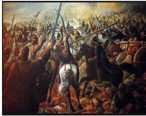
Fig 3. Second and third battle of panipat