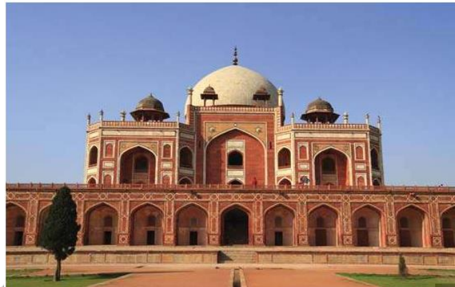
Fig 3. Humayun Tomb

To the east of Akbar's realms, the Suri general Hemu had set himself up as a strongman ruler; calling himself a king, he built a powerbase in Bengal. Aged just thirteen, Akbar seemed singularly ill-equipped to cope with this threat. However, he had rare gifts and the support of his guardian, the accomplished general Bairam Khan. Hemu had unstoppable momentum, it seemed having already taken Agra and the strategic fortress of Tughlaqabad, in October 1556 he captured Delhi. Too late to save the city, Akbar's army let it go and stopped on the plains to the north, at Panipat.