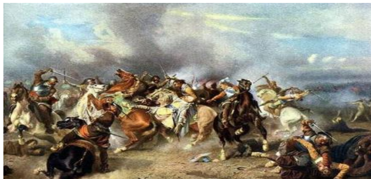
Fig 2. First Battle of Panipat

These territories had for three centuries belonged to a Muslim empire, the Delhi sultanate. Although its prestige had been badly damaged by Timur's triumph of 1398, it remained a powerful presence in northern India. At this time, the sultanate was under the control of an Afghan elite. A capricious and divisive ruler, Sultan Ibrahim Lodi had alienated many of his nobles. It was indeed a local lord in Hindustan who, in 1523, invited Babur to undertake a full-scale invasion.