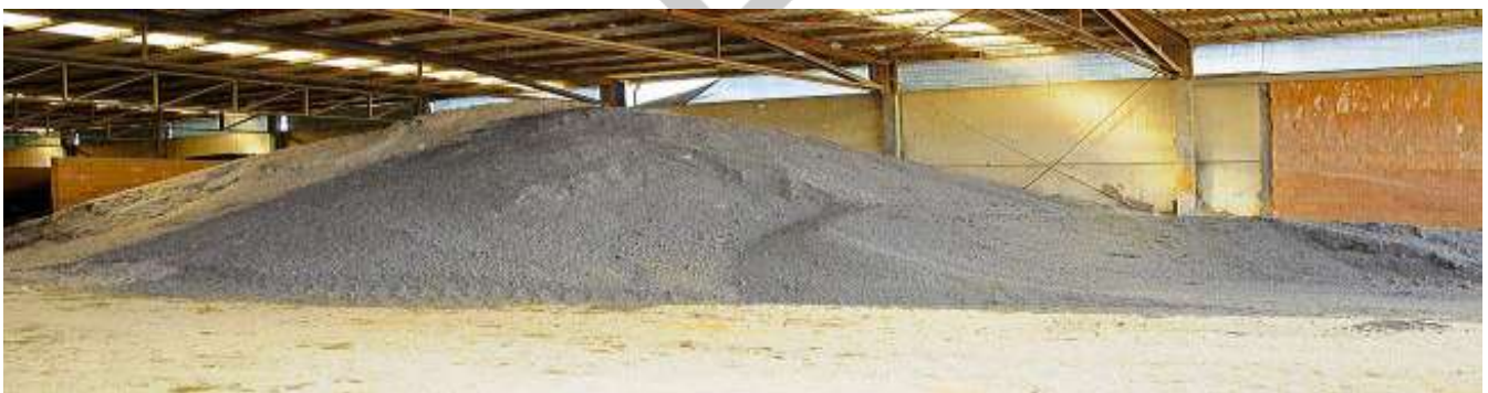
Fig1: - Paper sludge stored before processing

Material properties Cement, natural fine aggregates, natural coarse aggregates, recycled coarse aggregate, recycled plastic coarse aggregate, water are to investigate. Primary and secondary sludge may be expected to contain settleable materials from raw wastewater and the products of microbial synthesis. Other materials are also removed from wastewaters and incorporated into primary and secondary sludge. The large surface area of particles incorporated into sludge provides sites for adsorption of constituents from the liquid phase. Non-degraded organic compounds in solution may partition into the organic fraction of the particles. Bio flocculation may incorporate colloidal particles that otherwise would not be removed by sedimentation into settleable particles. These and other mechanisms result in selective enrichment of wastewater constituents in sludge.