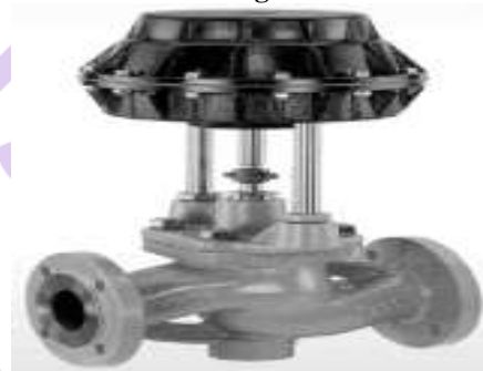
Fig 2.3.4 Globe & modulating valves

Our pneumatically operated 2/2-way globe valve has a low maintenance membrane actuator which can be controlled by inert gaseous media. The valve plug is fixed to the spindle in such a way as to allow flexing during closure in order to ensure tight shut off. The valve spindle is sealed by a self-adjusting gland packing providing low maintenance and reliable valve spindle sealing even after a long service life. The wiper ring fitted in front of the gland packing protects it against contamination.