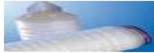
Fig 2.3.19 Air, gas &amp; liquids filters

Our filters have been developed to be used as air, gas and liquids sterilizing filters in the pharmaceutical and biotechnology industries. We have the most popular brands available on the market.