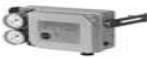
Fig 2.3.6 Pneumatic positioners

We offer pneumatics positioners to be used with our control valves. Single-acting or double-acting positioners for pneumatic control valves belong to the classics in our brand's product range. Already proven in thousands of applications, they provide safety in processes.