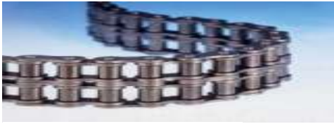
Fig 2.3.14 Stainless steel chains

Standard roller chain is broadly used in power transmission applications ranging from general industrial applications to demanding oil field service to operation in such specialized areas as food processing and heavy construction equipment. Single and multiple standard roller chains, available in many sizes, meet most drive requirements.