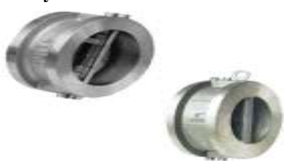
Fig 2.3.2 sanitary check valves

Our stainless steel check valves are suitable for use on a wide range of fluids for applications in process lines, hot