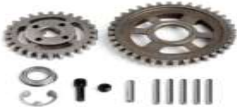
Fig 2.3.15 Gears &amp; components

Designed to meet the tough challenges of medium and heavy-duty operations, our gears give you everything you choose for outstanding design, durability, minimal failure, easy maintenance and overall efficiency.