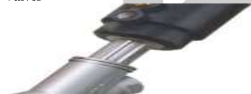
Fig 2.3.1 Piston actuated valves

Our piston actuated valves provide a competitive solution for OEM on/off control applications by combining many key benefits in one valve. A unique quality product designed to meet our customer's needs offering reliability combined with high performance shut-off.