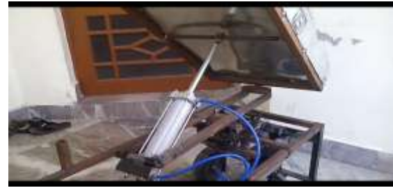
Fig 1.3 unloading in back word direction