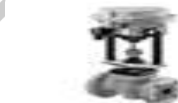
Fig 2.3.5 Pneumatic control valves & actuators

Our pneumatically operated control valves have been especially developed to conform to the stringent regulations in the field of cryogenics as well as in the pharmaceutical and food processing industries. The requirements placed on control valves intended for processing plants vary considerably depending on the field of application. Therefore our valves are designed as modular assemblies that allow us to respond with utmost flexibility to our customers' requirements.