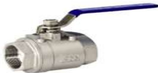
Fig 2.3.3 Stainless steel ball valves

Manufactured to stringent specification providing reliable tight shut-off and less maintenance. Wide range of sizes, materials & body design option providing a suitable model for any application. Precision design providing compact valves and corrosion resistant bodies ensure long life of the product.