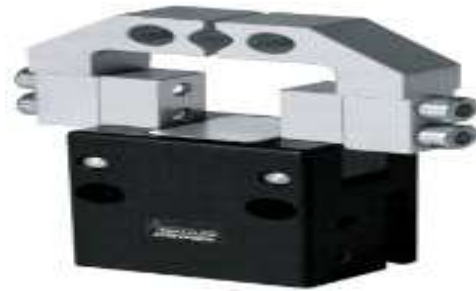
Fig 2.3. 10 Grippers

The functions of our grippers (Grip and rotate) can be controlled separately either 90° or 180°, combined in a compact module. The grippers opening angle is infinitely adjustable from 1° to 180°. At 180° opening angle, the workpiece is clear of the jaws, therefore no linear retraction stroke is needed.