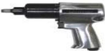
Fig 2.3.17 Power tools

One wrench, many jobs. Wrenches, hammers, screwdrivers and so on. Be prepared for any project, our reinforced tools will help you to do any job. They are heavy duty and easy to