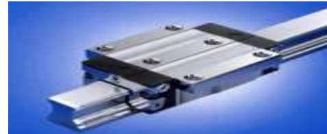
Fig 2.3.13 Ball rail systems

Make up your own compact linear motion guideways from interchangeable standard stock elements. We offer ball guide rails and ball runner blocks with such high precision, especially in the running rack zone, that each individual component element can be replaced by another at any time.