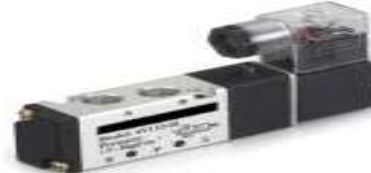
Fig 2.3.12 Solenoid valves

We offer a full line of directional (spool and poppet), proportional, pressure, flow, check, logic cartridges, "sandwich" (modular), and cartridge type valves. This is the best formidancing hydraulics systems applications – requiring for example, standard pressure capability to 4500psi and higher, coupled with flow limitations measured to the 1000's of gallons per minute.