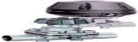
Fig 2.3.7 sanitary diaphragm valves

The diaphragm pneumatically operated 2/2-way diaphragm valve has a low maintenance actuator. Normally Closed, Normally Open and Double Acting control functions are available. The modular actuator system permits a variety of options to be used such as tank bottom valves, T valves, sampling valves, multi-port valves and tandem welded configurations.