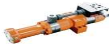
Fig 2.3.11 Hydraulic cylinders

We offer you a well-structured and systematically engineered range of hydraulic cylinders geared to your application requirements. Our cylinders line conforms to NFPA, ISO, and DIN standards and is 100% tested. The cylinder product range constitutes three different categories according to design type.