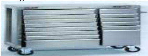
Fig 2.3.18 Storage

Keep all your tools together and organized, this is the best way to find them fast. Our storage bins features a rugged construction that provides your tools with optimal protection against harsh environments. The Portable Tool