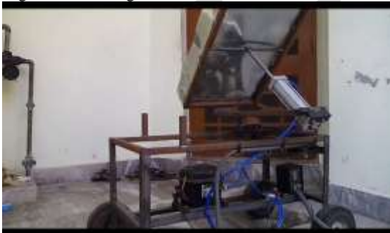
Fig 1.2 unloading in left direction