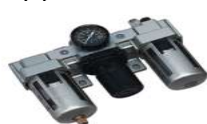
Fig. 2.3.9 Air preparation & hoses

Choose from a range of high performance and efficient Air Preparation products for your application needs. Parker offers a large selection of filters, lubricators, pressure regulators, air dryers and combination units.