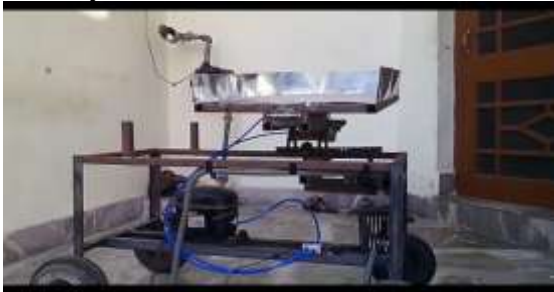
Fig 1.1 unloading in left direction