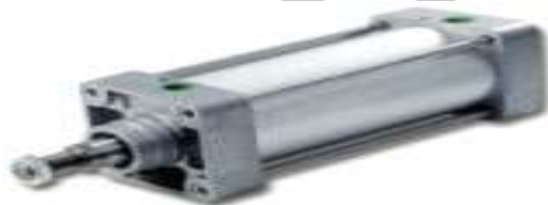
Fig. 2.3.8 Pneumatic cylinders

Our pneumatic cylinders will vary in appearance, size and function, they generally fall into one of the specific categories. However there are also numerous of types of pneumatic cylinder available, many of which are designed to fulfill specific and specialized functions. You just have to ask what you need for your specific application